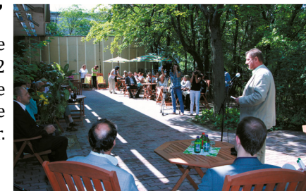
The opening of the EcoTerrace, 15 June 2012