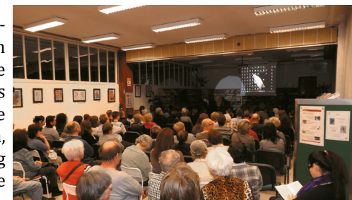
Over the 50th Eco-evenings lecture

Our lecture series called „Eco-Evenings”, organized continuously from October 2010. The 60th lecture took place at the start of 2016. The primal topics are: the sustainability, the renewable energies, the environmental protection, the environmental education, the living together doctrine, the strengthening of the view about environment consciousness.