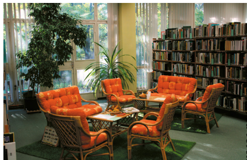
EcoCorner in the library

The forming of the “EcoCorner” begun in that time with him as well. These are highlighted documents of the library, a selection from the topics of sustainable development, environmental awareness and protection, the human ecology, the doctrine of living together; the alternative and renewable energies, and the planetary and cosmic awareness.